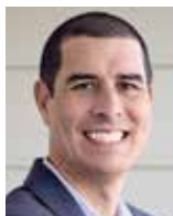
JR Russell McCullough Construction, LLC