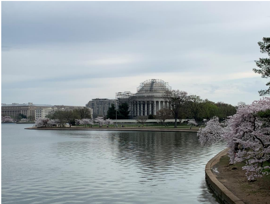
Asbestos Abatement at the Jefferson Memorial