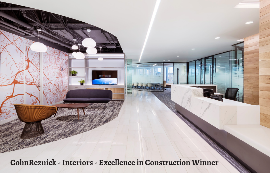
CohnReznick - Interiors - Excellence in Construction Winner

PROUD SPONSER OF ABC OF METRO WASHINGTON