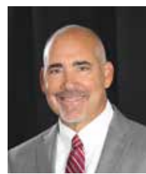
Leigh Press Past Chair PCC Construction Components, Inc.