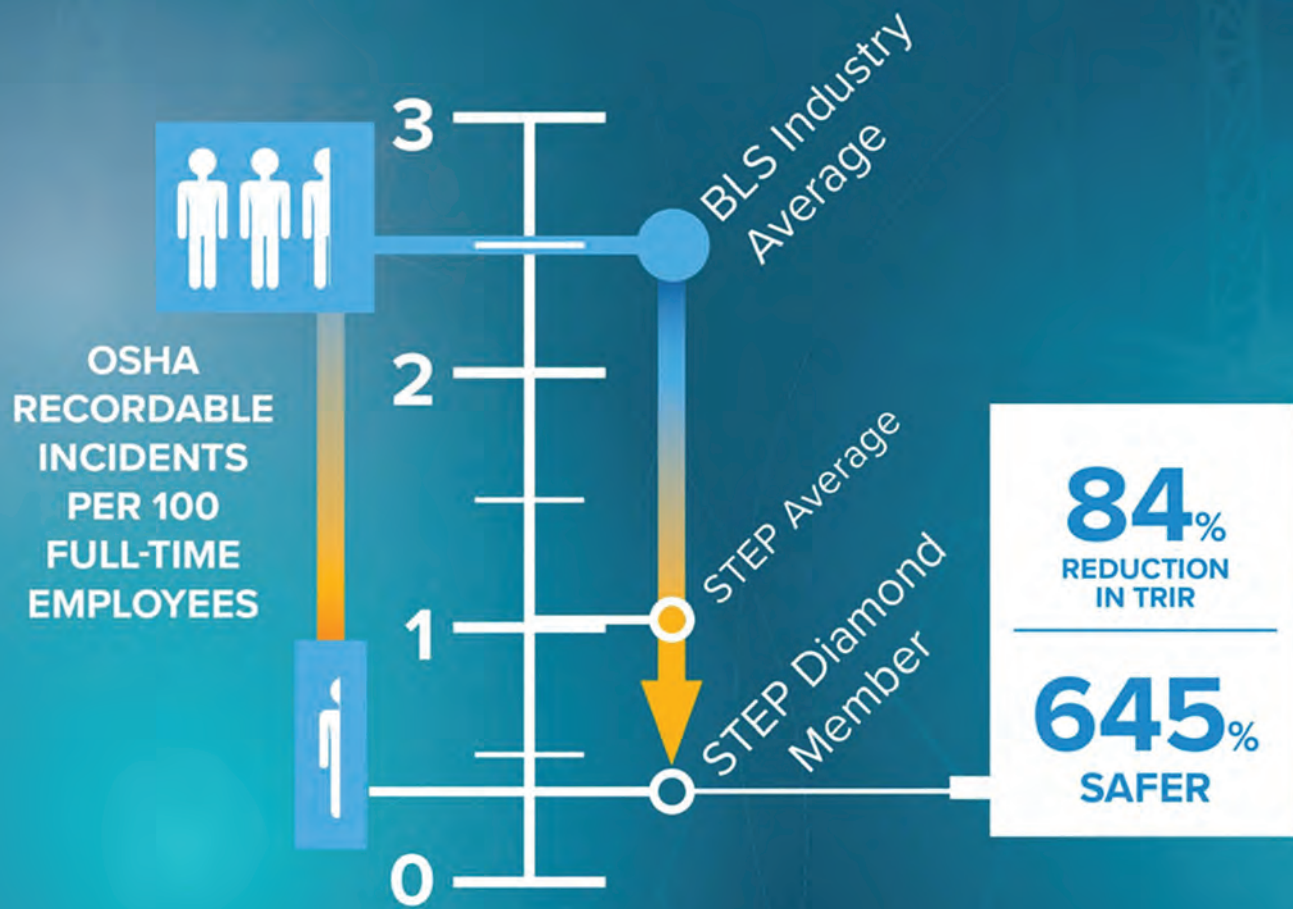
Total Recordable Incident Rate: STEP vs. the U.S. Bureau of Labor Construction Statistics Industry Average

ABC's Safety Performance Report presents empirical evidence from members doing real work on real projects that shows that implementing STEP best practices can produce world-class construction safety programs.