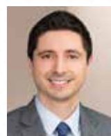
Jackson Nichols Cohen Seglias Pallas Greenhall & Furman PC