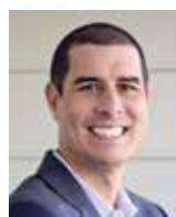
JR Russell McCullough Construction, LLC