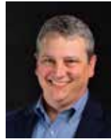
Wade Miller Donohoe Construction Company