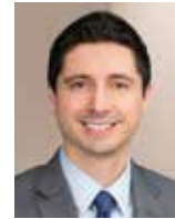
Jackson Nichols Cohen Seglias Pallas Greenhall & Furman PC