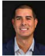
JR Russell McCullough Construction, LLC